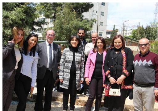
@ 150th Time Capsule Event